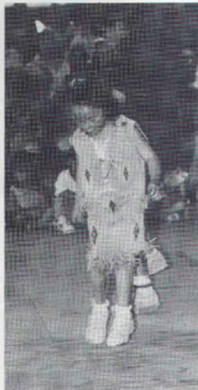
← One of the most popular events at Back to Batoche '93 proved to be the jigging competitions. Crowds packed the bleachers and walkways of the main tent anxious to check out the fiddling and novice and veteran jiggers