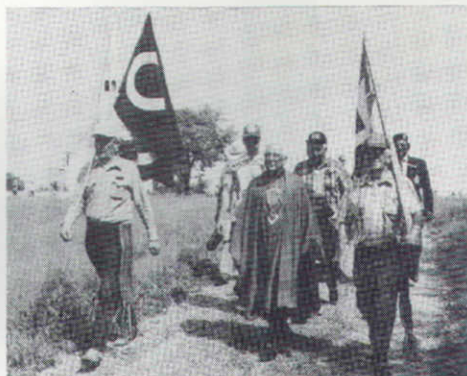
Sunday morning's procession to the cemetery was one of the more solemn and moving moments during the weekend