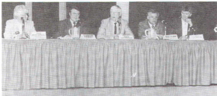
The political panel squares off in Prince Albert on September 30

"It is tough, but it is getting better. It seems like we're contacting employers and then we will say if you need anyone, call us, so we're getting out and letting people know that we are here and we have people who are trained," she concluded.