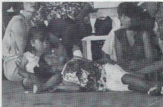
↓ Even with the high temperatures in the main tent, some Back to Batoche visitors could still enjoy kicking back during jigging competitions