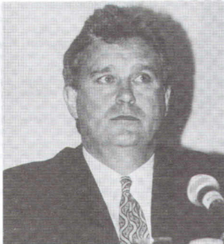
MP Chris Axworthy