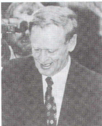
Liberal leader Jean Chrétien works the crowd during a Saskatoon appearance September 13.

"When there is construction in a city it is a kick start. If you go in a city and see stores